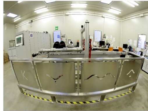
Kyma instrumentation

Option 3 The National Institute of Oceanography and Applied Geophysics – OGS